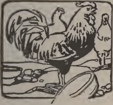
The King Rooster Was Crowing.

J ACK and Evelyn had been taken to an entertainment in the city that afternoon, and when daddy came home that evening they told him all about it. Clever dogs, hens and roosters had performed.